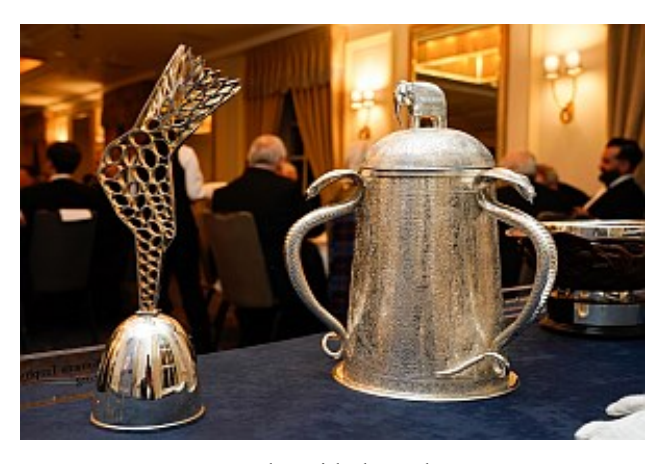
Women's Trophy with the Calcutta Cup