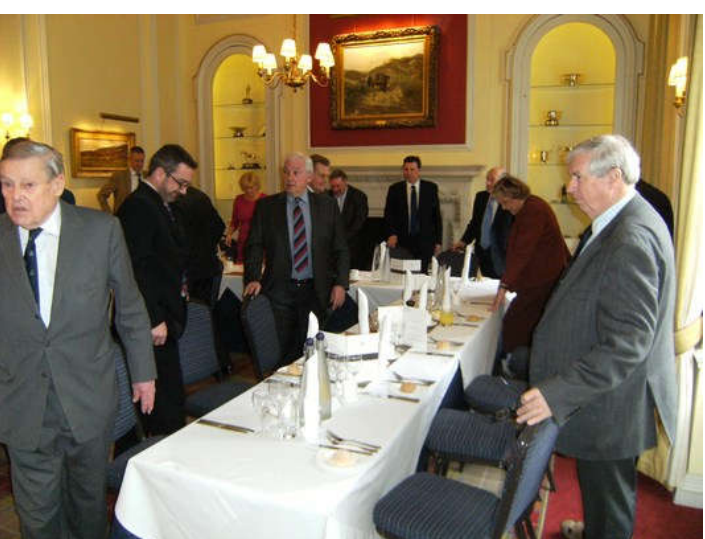
Lunch at the Caledonian Club

Friends of Scottish Rugby thank our Sponsors and Supporters for their generosity