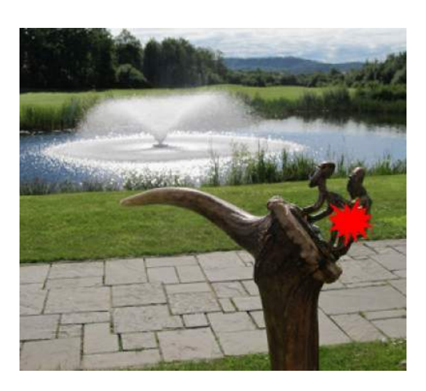
The Stick enjoys the tranquillity of the Carrick Golf course - Loch Lomond