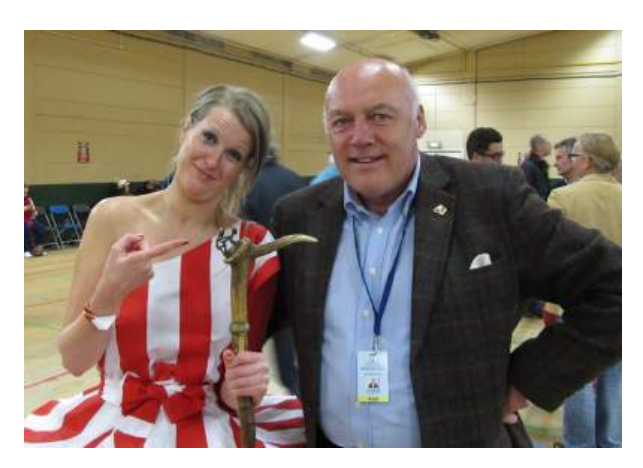
Galsgow Warriors - the trip is nearly over

Friends of Scottish Rugby thank our Sponsors and Supporters for their generosity