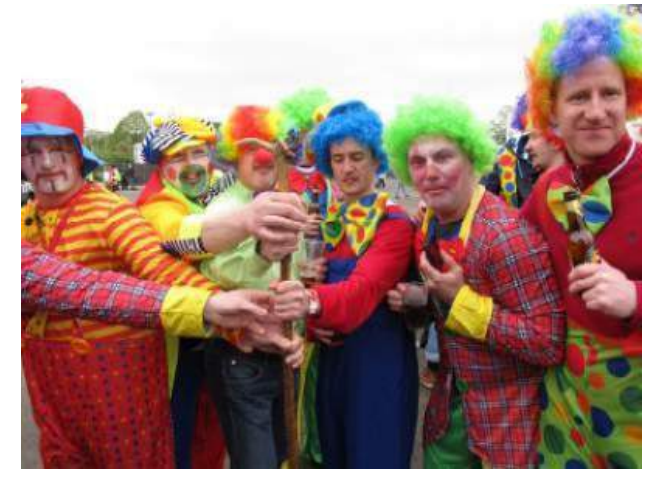
The fun goes on at HSBC Emirates 7s